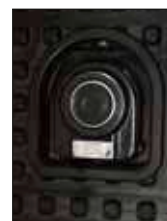
Dead man foot pedal